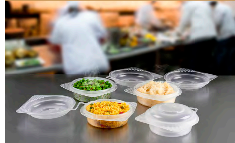
One of the restaurant customers of an SHC client saves many tonnes of plastic a year by using recyclable microwavable reusable portion packaging, instead of single-use plastic packaging.

PPWR builds on, rather than replaces, existing rules such as the Single-Use Plastics Directive, which already bans items like plastic cutlery and requires specific labelling for certain products.