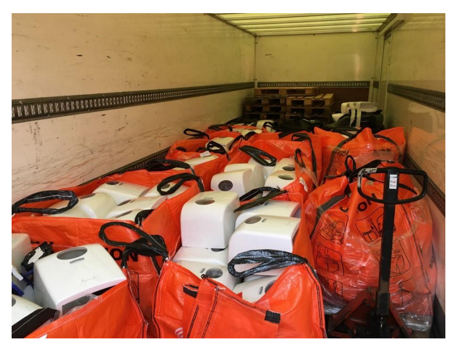
The RightCycle™ Programme is the world's first service to offer both dispenser installation and recycling.